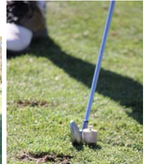
What is the proper way to tee up a marshmallow for the longest drive?