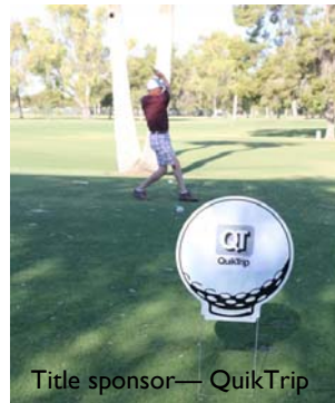
Title sponsor— QuikTrip