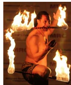
Polynesian Fire Dancer performs closing act of the evening.