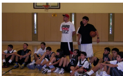
MAPPs league featured motivational speakers between each game. Pictured here is the Golden Gate Community Center team—league winners for the 2nd straight year.

Our MAPPs group continued the traveling youth basketball league, continued dialogue with other youth providers, and expanded the scope of our Maryvale Youth in MOTION group to include our teen leadership program as part of their monthly meetings. As other groups continue to look at MAPPs as a way to sustain their community programs, MRC has been approached as to how they can implement a MAPPs group in their own Valley community.