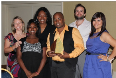
MOTION leaders and advisors with their APRA award

The first annual educational haunted house—one that shows you the unexpected consequences of life's choices—won the 2011 Arizona Parks and Recreation Association (APRA) Youth Enrichment Program Award. Fueled by the honor, the 2011 event was even more successful. It was attended by more than 200 youth. Each room featured a different theme: the dangers of drunk driving, tobacco use, gangs and drugs, as well as others.