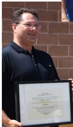
QuikTrip—Business of the Year