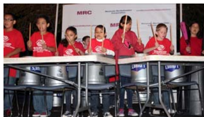
Stewart Boys & Girls Club Stomp Band