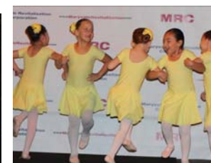
Maryvale Community Center youth