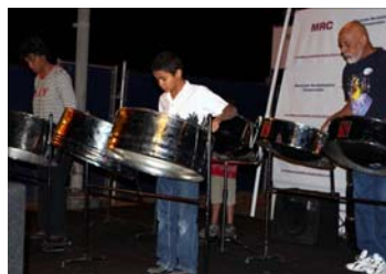
Opening act—Caribbean Zone

The second annual Community Garden in Harmony was held November 2011 at Ashley Furniture HomeStore Pavilion. The event featured a variety of acts, including some with local youth performers. Sponsored by USA Pawn & Jewelry, the multi-cultural showcase was attended by 150 people and raised funds to help promote MRC's youth programs.