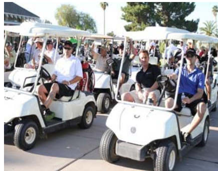
All set and ready to get started.

ate who was killed in an automobile accident coming home from college. The program has been expanded over the years to provide opportunities to students from Alhambra, Maryvale and Trevor Browne high schools.