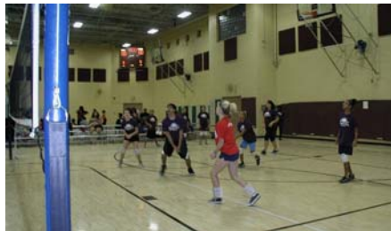
In 2012, the MAPPs program added volleyball to its sports league, joining the ongoing basketball league. Desert West Park added a new teen program following the league.