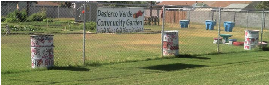
Urban Art meets community gardens as painted barrels are used for trash and washing vegetables at Amigos Center.

A special heartfelt thanks to all of our donors and volunteers who have helped MRC continue to expand services throughout the year!