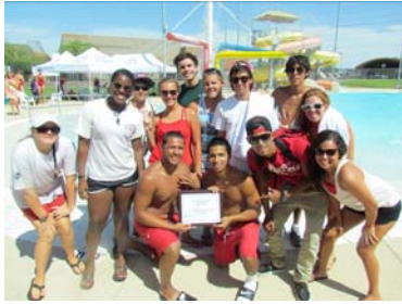
Above: MRC sponsored youth to get life guard jobs in 2102.