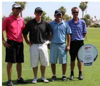
One of the 28 foursomes participating in the event