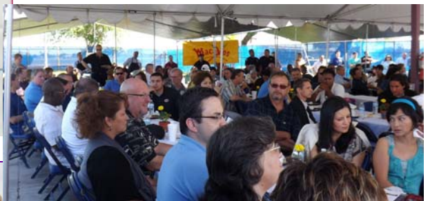
Attendees dined under the big top