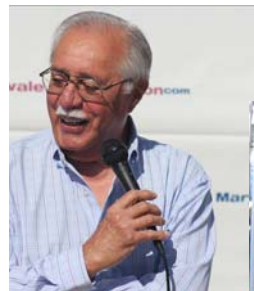
Keynote—Congressman Ed Pastor

Awards for Proof Positive, Educating Excellence, Business of the Year, Maryvale Hero, Woman of the Year and Man of the Year were presented at the event. The event hosted 175 attendees and had a great meal provided by Macayo's Desert Sky.