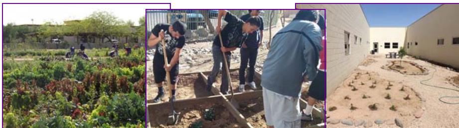
Community Gardens flourished from seeds and plants donated by Jackrabbit Nursery and Wal-Mart.