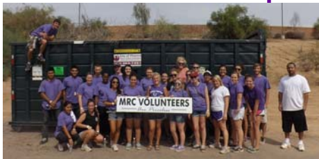
Below: Some of our best volunteers—Grand Canyon University students!